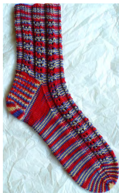
#T306 Summer Solstice (left) Shepherd Sock #103 Lorikeet