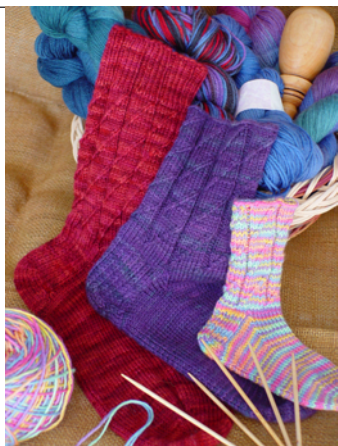
#T310 Everybody Wants Sox! Shepherd Sport #62 Childs Play (child's size model only in trunk show)

Selected HeartStrings sock patterns modeled in Lorna's Laces Yarns