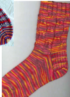
#T309 Autumnal Equinox (right) Shepherd Sport #146 Flames