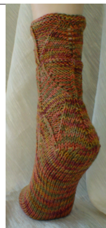
#S05 Shapely Sandal Socks Shepherd Sock (2 strands) #64 Gold Hill