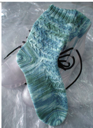
#T304 Rainy Day Socks Shepherd Sock #162 Icehouse