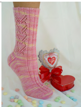
Valentine – the February pattern in The Sock Journal book Shepherd Sport #801 Sherbet