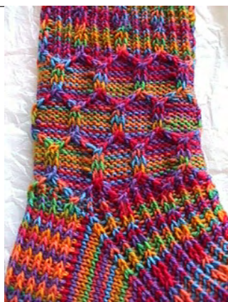
#A86 Circle of Friendship Socks Shepherd Sock #601 Rainbow