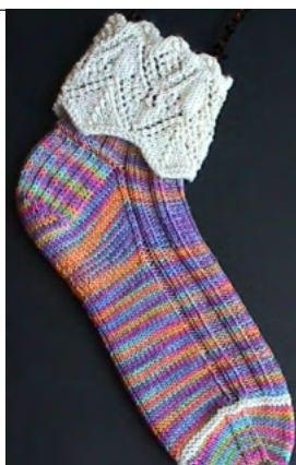
#A82 Peek-a-Boo Flowery Lace Anklets Shepherd Sock #62 Childs Play and #0ns Natural