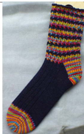
#A84 Cable Ride Shepherd Sock #601 Rainbow and #24ns Navy