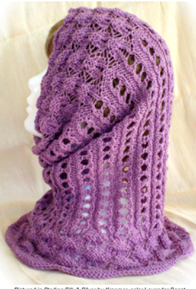
Pictured in Sterling Silk & Silver by Kraemer, color Lavender Scent

Enjoy this versatile accessory pulled over the head as an elegant hood-type head covering with the lace puffs framing the face, or worn as a softly folded cowl-like necklace.