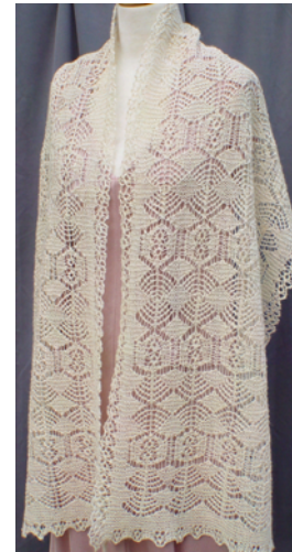
Medium-width stole pictured in Kraemer Yarns Sarah, 60% Suri alpaca/40% Merino wool, color natural

Skill level: Recommended for experienced lace knitters and confident intermediates only. The small scarf can be used as a practice piece before attempting the larger projects. Stitch instructions are presented in both charted and text formats.