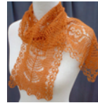
Small scarf pictured in Classic Elite Yarns Silky Alpaca Lace, 70% alpaca/30% silk, color 2910

Instructions are included for a small delicate scarf and for stoles in 3 widths. All are made in one piece from end to end with edging knitted as you go.