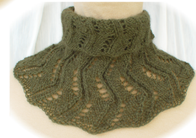
Shown in Windy Valley Musk Ox 2/14 Laceweight, 100% Qiviut, color Arctic Moss

Since this project takes only a relatively small amount of yarn, it is ideal for indulging in a luxury fiber such as qiviut.