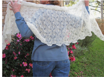
Shown in Colinton Australian Angoras Ultrafine Laceweight Kid Mohair; Miyuki seed beads, color 6-131S Silver-lined Crystal

White Lotus features lovely scintillating organic forms enhanced by beaded nups. The lotus flowers are framed by the bobble-like texture of the nups, and the beads appear as dew drops on the flowers.