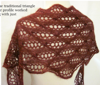
Shown in Qiviuk Silk Blend by Jacques Cartier, 50% qiviuk/50% mulberry silk, 217 yds/28g - 2 balls, color maroon

Several ideas of ways to wear this garment are included.