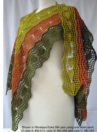
Shown in Himalaya Duke Silk yarn using one skein each of color A: #SI-013, color B: #SI-006 and color C: #SI-007

Another feature of the stole is a lengthwise separation to form two narrower sections of three strips each that give variety to the ways this stole can be worn. We especially like to wear this style with the wider section laying on one shoulder and the 'tails' simply flung over the other shoulder.