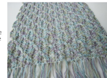
The cables are carried out to each edge of the wrap, preserving the overall flow of the curving lines.

Lace patterning on every row Cabling without a cable needle Attaching fringe