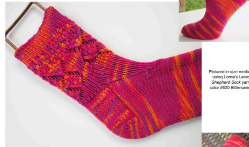
Pictured in size medium using Lorna's Laces Shepherd Stock yarn, color #B30 Bittersweet.

Red Hots Anklts are named after the small nuggets of the popular cinnamon-flavored candy. The pattern stitch incorporates wrapped stitches to simulate the candy nuggets.