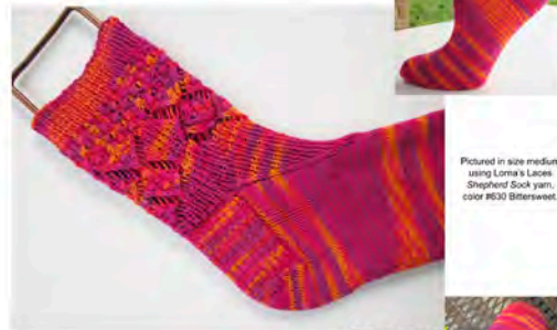
Pictured in size medium using Lorna's Laces Shepherd Sock yarn, color #833 Bittersweet.

Red Hots Anklets are named after the small nuggets of the popular cinnamon-flavored candy. The pattern stitch incorporates wrapped stitches to simulate the candy nuggets.