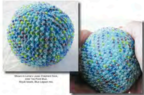
Shown in Lorna's Laces Shepherd Sock, color Ina Pond Blue. Miyuki beads, Blue Lagoon mix.

Squish and roll this beaded ball around in your hands to provide relaxation and quick relief to stress, aching or stiff finger joints. Tiny pressure points of beads have a meditative quality. These balls make a quick, low-cost and much-appreciated gift. Make them bright and colorful for a cheerful uplift, or in subtle colors to fit your most reflective mood.