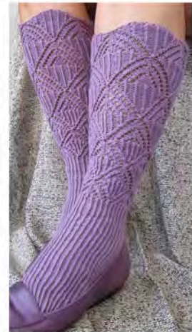
Shown in Tili Tomes Austrian Sock yarn, color #059 Mist

Sizing Women's medium. Unstretched measurements: Upper leg - 11¼" / 28.5 cm Ankle - 7" / 17.75 cm