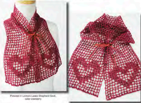
Pictured in Loma's Laces Shepherd Sock, color cranberry

Knit this short ascot-like scarf and wear a heart on your heart. The knitted lace mesh simulates the look of filet lace crochet or darned netting, but is actually knitted. A boldly outlined heart motif at each end of the scarf is set against the background of lace mesh.