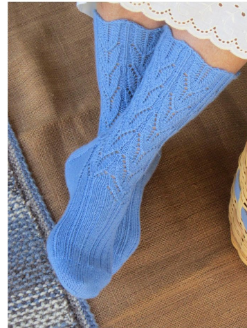
Pictured in Tilli Tomas Artisan Sock yarn, color #072 Lake

Dainty and dignified lace-patterned socks for the country girl at heart. Socks are slightly shaped below calf for a trim fit at ankle. Notch-edged bias lace panel ribbing at cuff transitions into an arrow-head lace pattern that narrows toward the ankle and continues into the instep. The arrow-head lace then changes into subtle ribbing along top of foot.