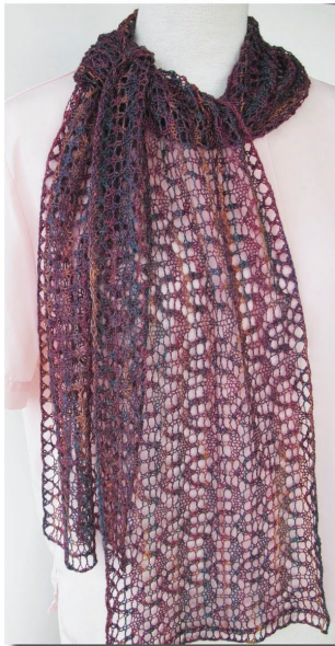
Shown in Mountain Colors Winter Lace Junior, color Red Willow

Overview of Construction Knitted side to side; no seams to sew