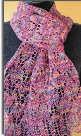
Shown in Mountain Colors Winter Lace Junior, color Prairie Rose