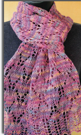
Shown in Mountain Colors Winter Lace Junior, color Prairie Rose