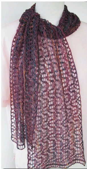
Shown in Mountain Colors Winter Lace Junior, color Red Willow