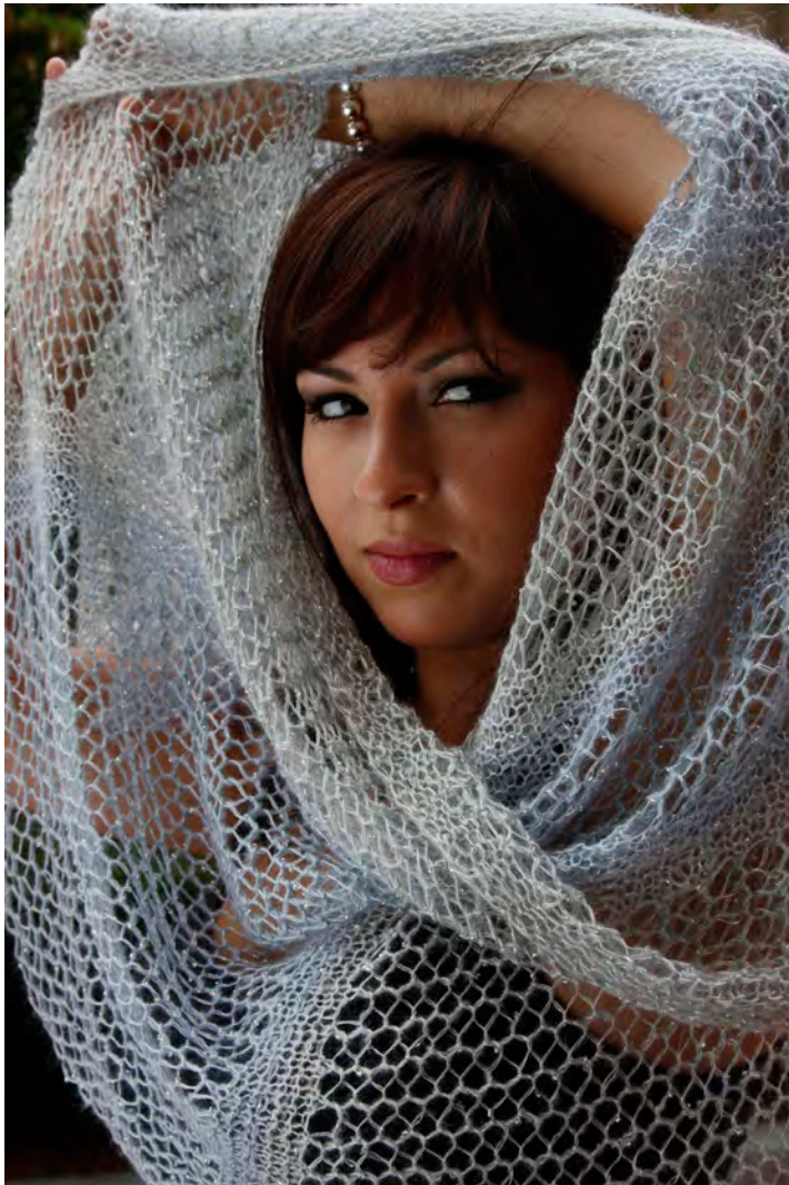
Shown in Symphony Kid Lace with Beads & Glitter by Tilli Tomas, colors Atmosphere (light gray) and Eternal Diva (soft gray-blue)

Half-note Symphony Shawl is designed to be attractive on a range of sizes and body types. Because of the fluid, amorphous character of the purl lace, this “one size fits all” shawl can be further varied by the degree of tautness in the blocking process (from relaxed to extremely stretched).